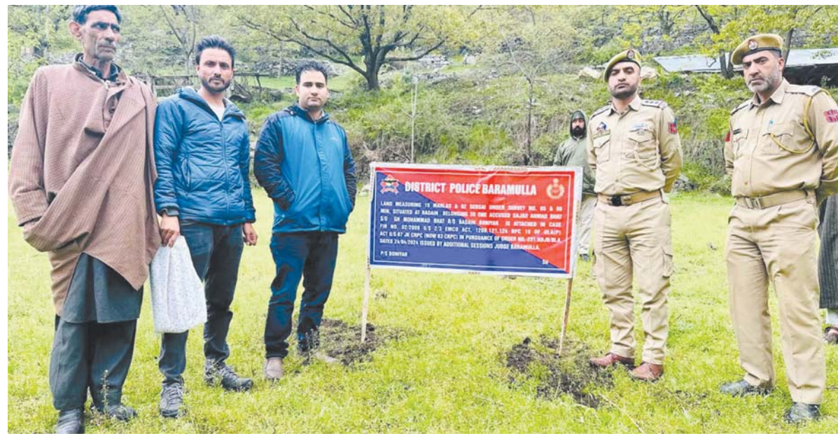
BARAMULLA, Police attached properties of 7 Pak based handlers in Jammu and Kashmir's Baramulla district on Wednesday.

Lucknow, May 1 (IANS) Uttar Pradesh Chief Minister Yogi Adityanath said on Wednesday that after Independence, the Congress became directionless and is now leaderless.