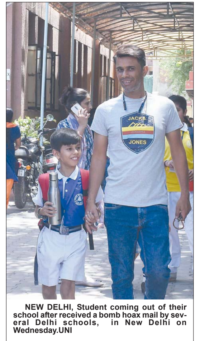
NEW DELHI, Student coming out of their school after received a bomb hoax mail by several Delhi schools, in New Delhi on Wednesday.

The notice said that if the producers do not abide by the conditions stated in the notice, they will have to "face serious legal repercussions."