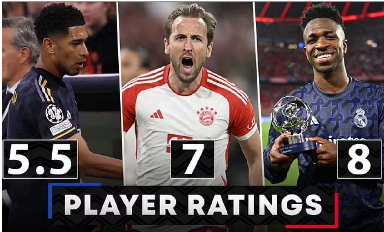
The spoils were shared in Germany as Bayern Munich and Real Madrid played out an enthralling 2-2 draw in their Champions League semi-final first leg tie on Tuesday. Thomas Tuchel's side started well at the Allianz Arena, but the Spanish giants struck first as Vinicius Jr (right) finished well after a delightful through ball from Toni Kroos. Bayern came out firing in the second half and Leroy Sané got them back on level terms following a fine run and finish, before Harry Kane put the hosts ahead from the spot when Jamal Musiala was fouled by Lucas Vazquez.

Lucknow, May 1 (IANS) As young fast-bowler Mayank Yadav walked off the field after complaining of discomfort during the IPL 2024 match against the Mumbai Indians (MI), former Australian fast bowler Brett Lee lashed out at Lucknow Super Giant's (LSG) management, saying they did not manage the pacer's injury well. Mayank, who returned for the Lucknow side after missing five matches due to soreness in the lower abdominal area, walked off the field on Tuesday without completing his fourth over, leaving with the figures of 1 for 31 in 3.1 overs. "Side strain, or whatever they're calling it, normally takes at least four to six weeks to even come right. We don't know the depths of how big a strain it was, but for somebody who is pushing the limits of their body by bowling 150 kmph, that's not good management at all. His first game coming back and getting injured, has to directly be on the leadership and the medical staff of the Lucknow Super Giants," said Lee on Jio Cinema, the tournament's official streaming partner.