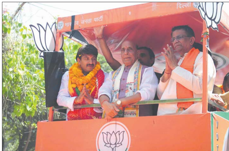
NEW DELHI, BJP candidate for North East Delhi Parliamentary constituency Manoj Tiwari with Defence Minister Rajnath Singh at a roadshow before filing his nomination papers at Yamuna Vihar, in New Delhi on Wednesday.

Both emphasised that the battle was the same for both the Congress and the Left Front against the dual rivals BJP and Trinamool Congress. The fact that Left Front-Congress unity in West Bengal would be strong in Murshidabad District compared to other pockets was evident from the time seat-sharing talks started between the two parties. While the CPI(M) readily agreed to forego its stake at Jangipur in support of the Congress candidate, the same flexibility was shown by another Left Front ally Revolutionary Socialist Party (RSP) in case of Baharampur.