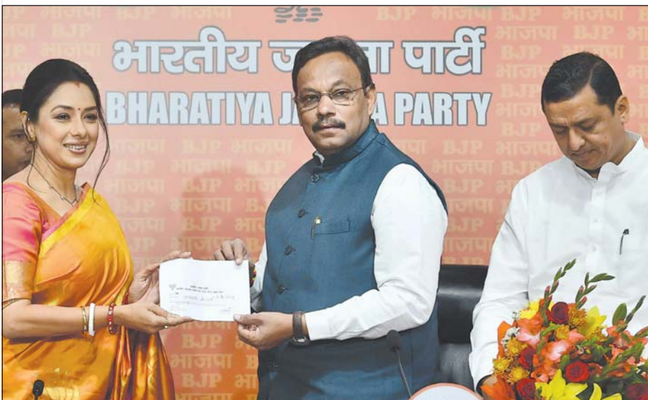
NEW DELHI, Actor Rupali Ganguly joins BJP in presence of party leaders Anil Baluni and Vinod Tawde, in New Delhi on Wednesday.

The two resignations from the party come close on the heels of veteran Congress leader Arvind Singh Lovely resigning as Delhi unit chief, over strong differences with the Central leadership.