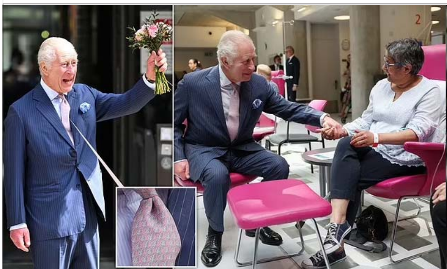
ROBERT HARDMAN: His tie said it all. It has been a favourite since he became King, appearing on away days, at Palace receptions and even a trip to church. Featuring a blue dinosaur pattern on a pink silk background, it is a cheeky play on his official 'Charles III Rex' cypher. Staff know that when 'C-Rex' is wearing his 'T-Rex' tie, he probably has a spring in his step. And so it was as the King came to the Macmillan Cancer Centre at London's University College Hospital to mark his cautious return to regular public duties for the first time since his own diagnosis in February.

Gaza, May 1 (IANS) The Palestinian death toll from ongoing Israeli attacks on the Gaza Strip has risen to 34,535, the Hamas-run Health Ministry said in a press statement. During the past 24 hours, the Israeli army killed 47 Palestinians and wounded 61 others, bringing the total death toll since the outbreak of the Israel-Hamas war to 34,535 and injuries to 77,704, Xinhua news agency reported. Some victims remain under the rubble amid heavy bombardment and a lack of rescue crews, said the statement on Tuesday. Meanwhile, the Israeli army reported attacking 24 targets in Gaza, including tunnel entrances and a missile launch platform, according to Israeli public radio. The General Directorate of Civil Defence in Gaza estimated that there were more than 10,000 individuals in total still missing beneath the rubble of the demolished buildings in the Strip.