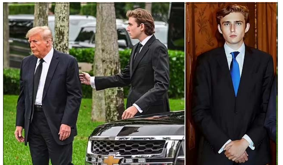
Former President Donald Trump has found out whether he will be able to go to his son Barron's graduation next month. The former president complained on the first day of the trial that he may be barred by Judge Juan Merchan from seeing 18-year-old Barron receive his diploma.

of bright lights and explosive sounds but without shrapnel, to stun the agitators. Police also arrested students who had set up a tent encampment in the university quadrangle and had been ordered by the university to clear out. Police clashed with students at the campus of local government-run City College, where agitators threw firecrackers, and arrested several people.