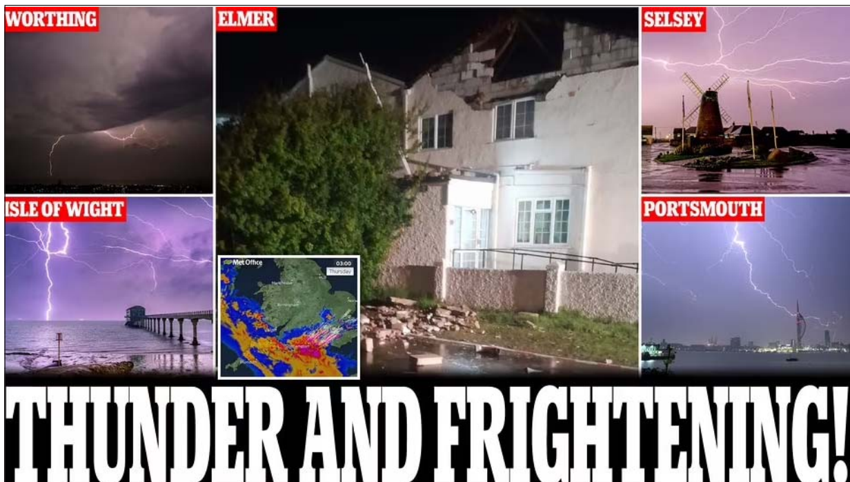
THUNDER AND FRIGHTENING! The Met Office said the downpours could flood homes, while there could also be power cuts and damage to buildings from strong winds. It comes ahead of what could be the warmest day of the year so far, as the Met Office has predicted some places could see their warmest temperatures of the year on Thursday. Temperatures are building this week with 22C (72F) highs expected for the South of England today, but experts predict a 'mixed bag' for this Bank Holiday weekend.

Amman, May 2 (IANS) Jordan's Foreign Ministry has condemned the assault by extremist Israeli settlers on two Jordanian humanitarian aid convoys to the Gaza Strip. The Ministry said on Wednesday in a statement that two of the convoys were attacked by extremists, and the Ministry considered Israeli authorities' failure to provide protection undermined all claims and commitments of the Israeli government to allow aid into Gaza, Xinhua news agency reported. The Jordanian Ministry held the Israeli authorities fully responsible for this crime, calling on the international community to take a clear stance condemning it and to compel Israel to fulfill its legal obligations and ensure the protection of aid convoys and international organisations working to receive and distribute them. Jordan's military and the Jordan Hashemite Charity Organisation dispatched a humanitarian aid convoy to northern Gaza earlier on Wednesday, marking the first time aid has entered through the Beit Hanoun crossing. In a statement, the Jordan Hashemite Charity Organisation said that 31 trucks would cross into the area, with an additional 48 trucks set to pass through the Kerem Shalom crossing, totaling 79 trucks. The Beit Hanoun crossing, known to Israelis as the Erez crossing, played a crucial role in connecting the Gaza Strip and Israel before the conflict. It primarily facilitated pedestrian movement rather than the transport of goods.