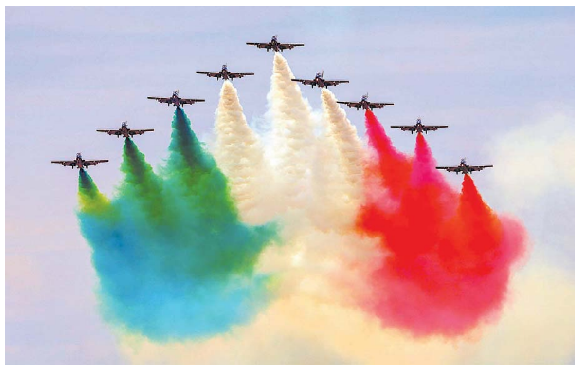
UDINE, The Italian Freccie Tricolori aerobatic squad performs during an airshow organized on the occasion of the 64th aerobatic season of the aerobatic squad, at Rivilto Air Force Base in Italy, May 1, 2024. The Italian Freccie Tricolori aerobatic squad will perform in many locations in Italy from May 5.