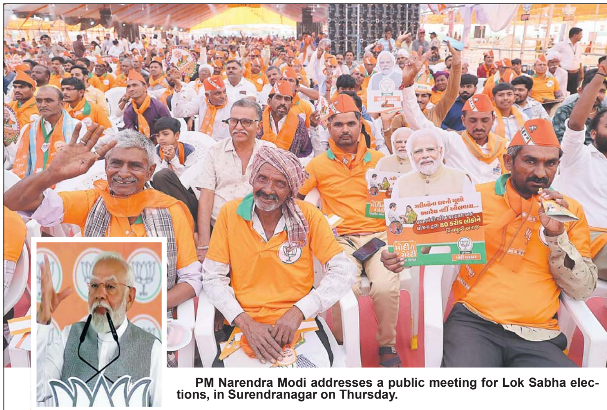
PM Narendra Modi addresses a public meeting for Lok Sabha elections, in Surendranagar on Thursday.

He said while Modi has been busy 'realising Sardar Saheb's dream of uniting the country, the Congress is busy dividing the country. Congress wants to create fights in the society'. "Before the arrival of Modi, there were 2 constitutions and 2 flags in this country," he said, adding a jibe at Rahul Gandhi without taking his name, "The prince's party Congress and his family members did not allow the Constitution to be implemented in the country. 'The Constitution of India was not applicable in Kashmir. Article 370 was sitting like a wall," he said reminding the audience of the Congress' rule, when the country faced the fate of two Constitutions and two flags one for Jammu and Kashmir and the other for rest of India. Taking full credit of the abrogation in 2019, Modi said: "This son from Sardar Vallabhbhai Patel's land demolished Article 370 and paid tribute to Sardar Saheb. Sardar sahab left