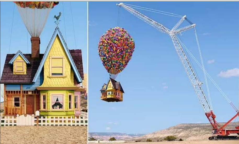
Airbnb launched its new 'Icons' collection on Wednesday where lucky guests will get the chance to live out their imaginations in movie-inspired homes, including one from Disney's UP. The UP house is located in Abiquiu, New Mexico and is hosted by none other than Carl Fredrickson. The experience to stay in the balloon-topped home is free, but guests will be 'randomly chosen.' According to the listing, Airbnb purchased Carl and Ellie's home to celebrate the 15-year anniversary of the movie

Seoul, May 2 (IANS) North Korea appears to have taken down a building located near the now-shuttered inter-Korean factory park in the North Korean border city of Kaesong, the unification ministry said Thursday. The dismantled building had been built outside the factory park by a South Korean company for investment purposes, a ministry official told reporters, without providing further details, Yonhap news agency reported. The official said the building had never been in use even when the Kaesong Industrial Complex was normally running before South Korea suspended its operation in February 2016 in response to the North's nuclear and long-range missile tests. Earlier this week, the Voice of America, a Washington-based news outlet, reported that the building located some 50 meters from the factory park entrance had been dismantled, citing satellite imagery. Once a symbol of inter-Korean reconciliation, the Kaesong complex was home to more than 120 small South Korean plants that produced garments and other labor-intensive goods by employing more than 54,300 North Korean workers. Amid frosty inter-Korean relations, North Korea blew up the joint liaison office in the Kaesong complex in June 2020 in anger over Seoul's failure to stop North Korean defectors from sending anti-Pyongyang leaflets across the border.