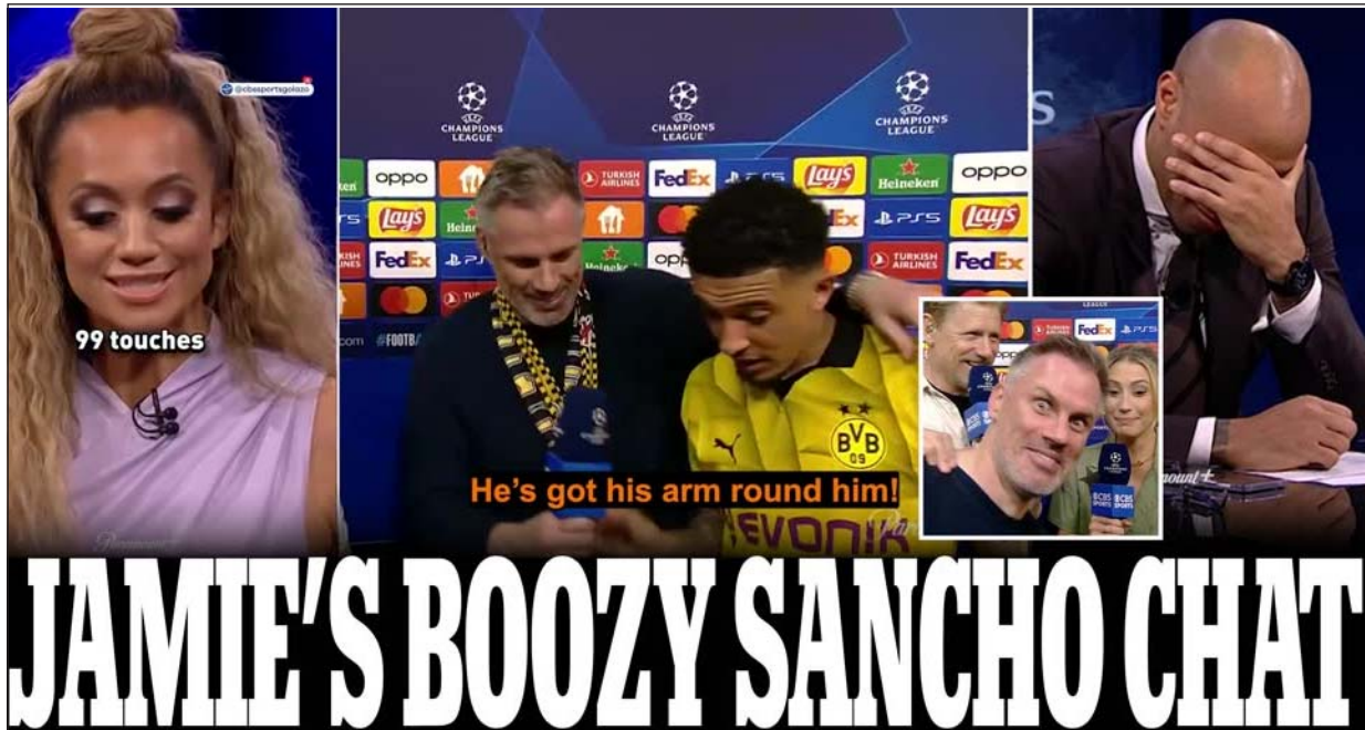
JAMIE'S BOOZY SANCHO CHAT Jamie Carragher's 'drunk' interview with Jadon Sancho (centre) after he downed eight pints on Borussia Dortmund's famous 'Yellow Wall' left the CBS studio in hysterics (left and right). The Liverpool legend turned pundit was sent to watch Dortmund's Champions League semi-final win over Paris Saint-Germain with the home fans. Carragher said he had no trouble getting a beer pre-match as he hailed his new Dortmund 'family and friends'. Viewers were then treated to a hilarious post-match chat between Carragher and Manchester United loanee Sancho, who enjoyed an impressive night.

Berlin, May 2 (IANS) Borussia Dortmund secured a crucial 1-0 lead over Paris Saint-Germain in the first leg of their Champions League semifinal, thanks to a decisive goal from Niclas Fullkrug. The match started evenly, with both teams creating opportunities. Ousmane Dembele and Marcel Sabitzer for Dortmund had chances to open the scoring, but the deadlock persisted until the 36th minute. Nico Schlotterbeck delivered a precise cross into the PSG box, finding Fullkrug who drove the ball past PSG goalkeeper Gianluigi Donnarumma to give Dortmund the lead. Dortmund maintained pressure, with Donnarumma making a critical save from a Sabitzer volley just before halftime. PSG intensified their attack after the break, with Kylian Mbappe and Achraf Hakimi hitting the post within minutes of each other, narrowly missing equalizers, reports Xinhua.