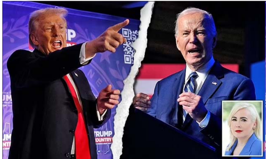
Just when you think Donald Trump can't outdo himself, he gives an explosive new interview to Time magazine and changes the landscape of the 2024 presidential election. In this profile, all-too-aptly-titled 'How Far Trump Would Go', the former and would-be next president left no key issue facing America untouched. But one exchange in particular might just have shifted everything.

Tehran, May 2 (IANS) Iran's Supreme Leader Ali Khamenei has reaffirmed the condemnation of US support for Israel's "crimes" in the Gaza Strip while commenting on the US Police's violent behaviour against pro-Palestinian protesters on college campuses. He made the remarks in a meeting with a group of teachers and academics in the capital Tehran on the occasion of National Teachers' Day, according to a statement published on Wednesday on his website. Khamenei said the US behaviour was indicative of its "partnership and complicity" with Israel in the latter's "horrific crimes and unforgivable sin". He highlighted the Gaza conflict as "the world's first issue," urging for more global pressure on Israel to stop its offensive in the Palestinian enclave, Xinhua news agency reported. The pro-Palestinian rallies have spread to other academic centres across the world, including Europe, demanding an end to Israel's attacks on Gaza. Israel has launched a large-scale offensive against Hamas in Gaza since October 7, 2023, after Hamas carried out a surprise attack on southern Israel that killed about 1,200 people.