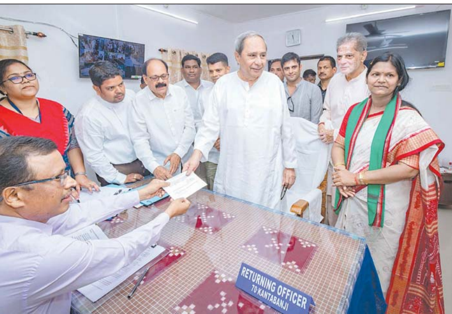
BOLANGIR, Odisha Chief Minister and Biju Janata Dal (BJD) President Naveen Patnaik files his nomination papers for State Assembly elections, in Kantabnaji of Bolangir district, two days after he filed his nomination from Hinjili constituency.