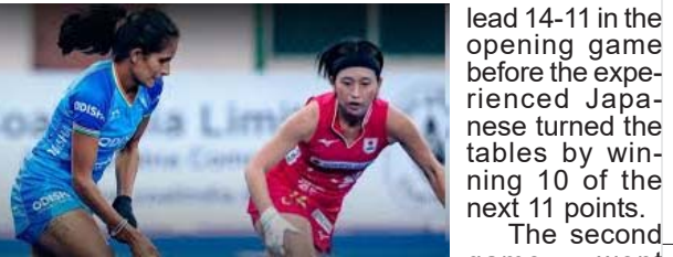
the young contingent.