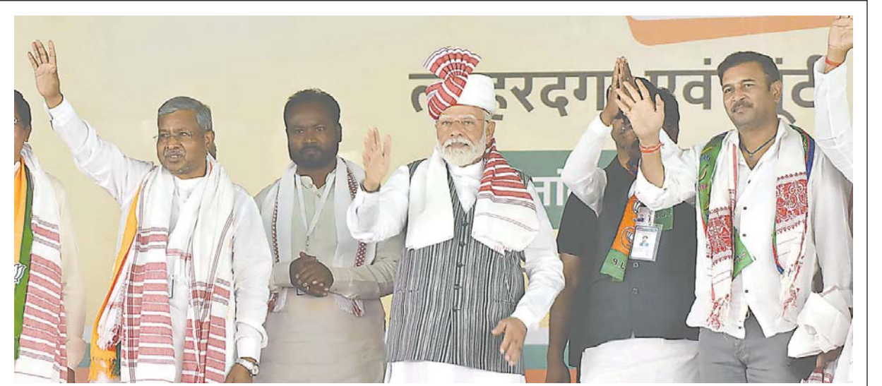
GUMLA, Prime Minister Narendra Modi waving supporters at an election campaign rally in favour of BJP Lohardaga Candidate Sameer Oraon and BJP Khunti Candidate Arjun Munda in Sisai, Gumla, Jharkhand on Saturday.

The Government had also allowed the export of 2000 metric tonnes (MT) of white onion cultivated especially for export markets in the Middle East and some European countries. Being purely export-oriented, the production cost of the white onion is higher than other onions due to higher seed cost, adoption of good agricultural practice (GAP) and compliance with strict maximum residue limits (MRL) requirements. The procurement target for onion buffer out of Rabi-2024 under the Price Stabilisation Fund (PSF) of the Department of Consumer Affairs has been fixed at 5 lakh tons this year.