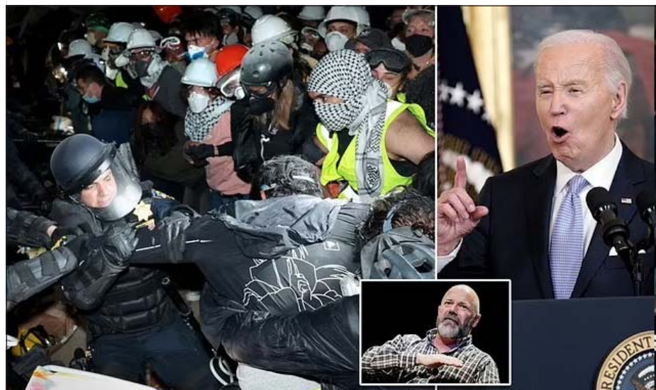
Conservative commentator Andrew Sullivan (inset), who is a conservative but a staunch critic of Trump, warned Biden's tepid response to the campus chaos of recent weeks is enough to cost him the election. Universities such as UCLA (left) have been rocked by unrest as pro Palestine protesters clash with administrators and the police. Sullivan claims this combined with Biden's failures on immigration and his stand on trans rights are enough to propel Trump back to the White House.

More than 24,000 people were displaced by the disaster, according to the agency. "These will be difficult days. We ask people to leave their homes. Our goal is to save lives. Things will be lost, but we must preserve lives. Our priority is to rescue people.