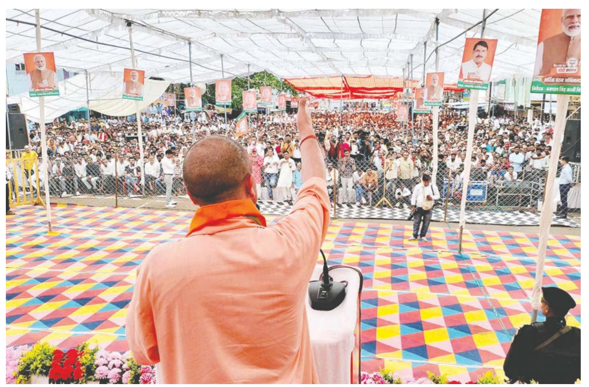
GUNA, Uttar Pradesh Chief Minister Yogi Adityanath addressing a public meeting, in Guna on Saturday.

Patna, May 4 (IANS) Prime Minister Narendra Modi will address a rally in Bihar's Darbhanga Lok Sabha constituency on Saturday.