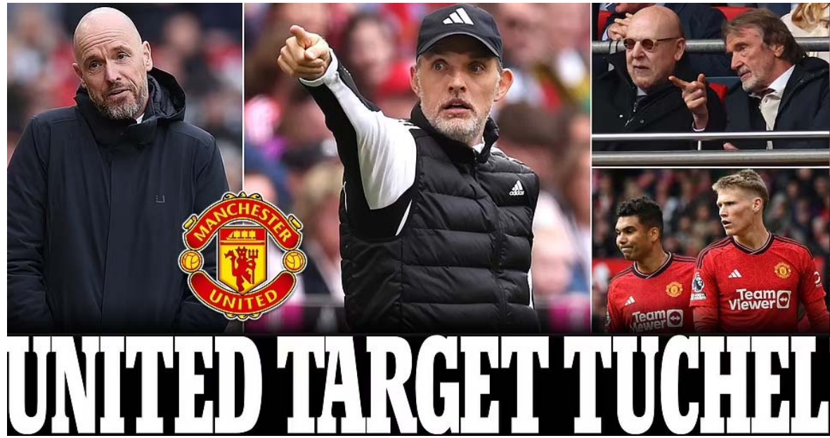
The German is poised to leave Bayern Munich at the end of the season, as announced in February, even though more than 19,000 supporters have signed a petition for him to stay. Ten Hag is fighting for his future with United sixth in the Premier League table and revving up for a repeat of last year's FA Cup final against Manchester City towards later this month.

The evening match between Auger-Aliassime and Lehecka was level at three games each when the Czech complained of a back problem. He attempted to continue after treatment, but only lasted three more points, before falling to the ground in agony as he looked to return and he was almost in tears as he left the court, reported Xinhua. "I couldn't believe that was happening, when he (Lehecka) put his hands to his back. I feel really bad for him," said Auger-Aliassime. "I don't know what he must have thought when he knew he couldn't continue. I really feel for Jiri, but I can't do anything," added the Canadian player.