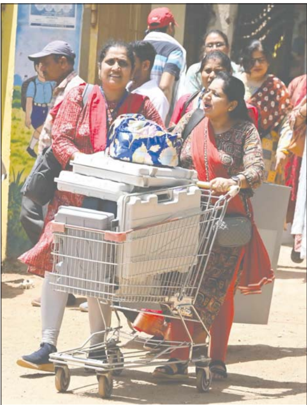
GAURELLA, Polling officials with election material leaving for their respective booths on the eve of the Third phase of the Lok Sabha elections, at Jashpur Chhattisgarh.