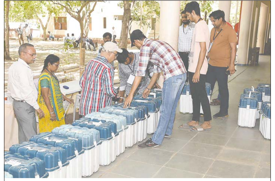
AHMEDABAD, Polling officials checking the Electronic Voting Machine (EVMs) and other election related material required for the 3rd Phase General Elections-2024 at the CN Vidhyalay Ambawadi, in Ahmedabad on Monday.

"After a 500-year wait, the long-cherished dream of Ayodhya has finally come alive with Ram Lalla once again gracing the city. This transformation of Ayodhya was made possible under Modi's leadership and guidance. Today, the new Ayodhya unveils a fresh chapter before us," he added.