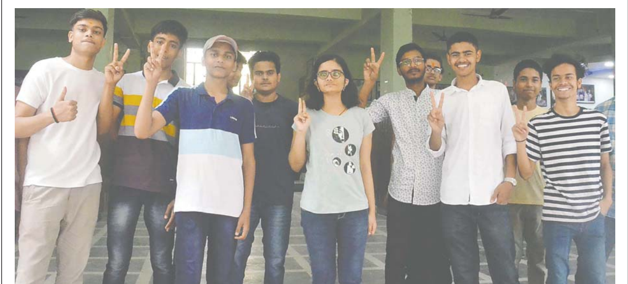
PATNA, Students celebrating their success after declaration of Class 10th and 12th results of the ICSE Exam, at a school in Patna on Monday.