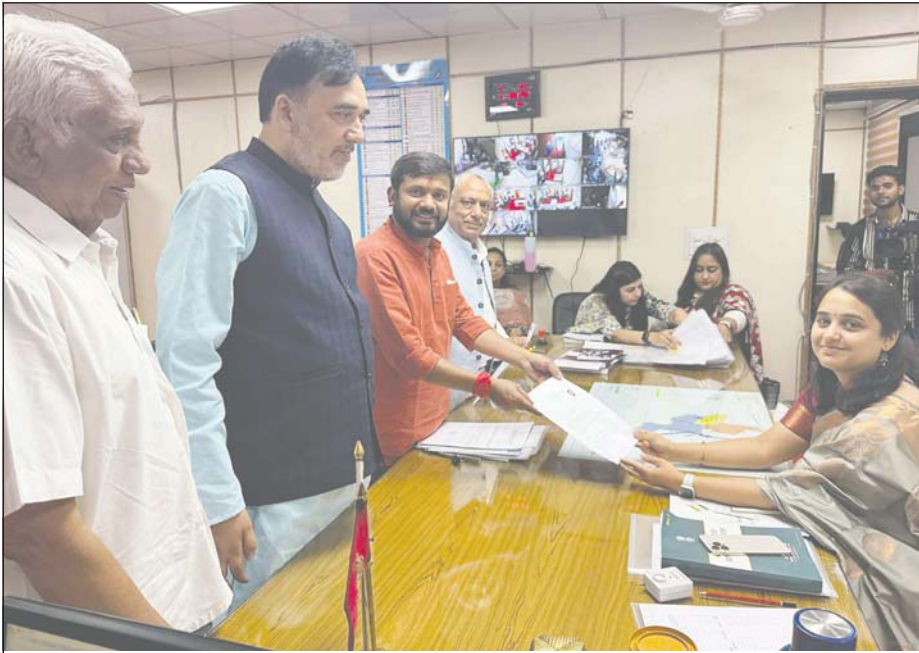
NEW DELHI, Congress candidate from North East Delhi Kanhaiya Kumar files his nomination papers for Lok Sabha polls in the presence of AAP leader Gopal Rai, in New Delhi on Monday