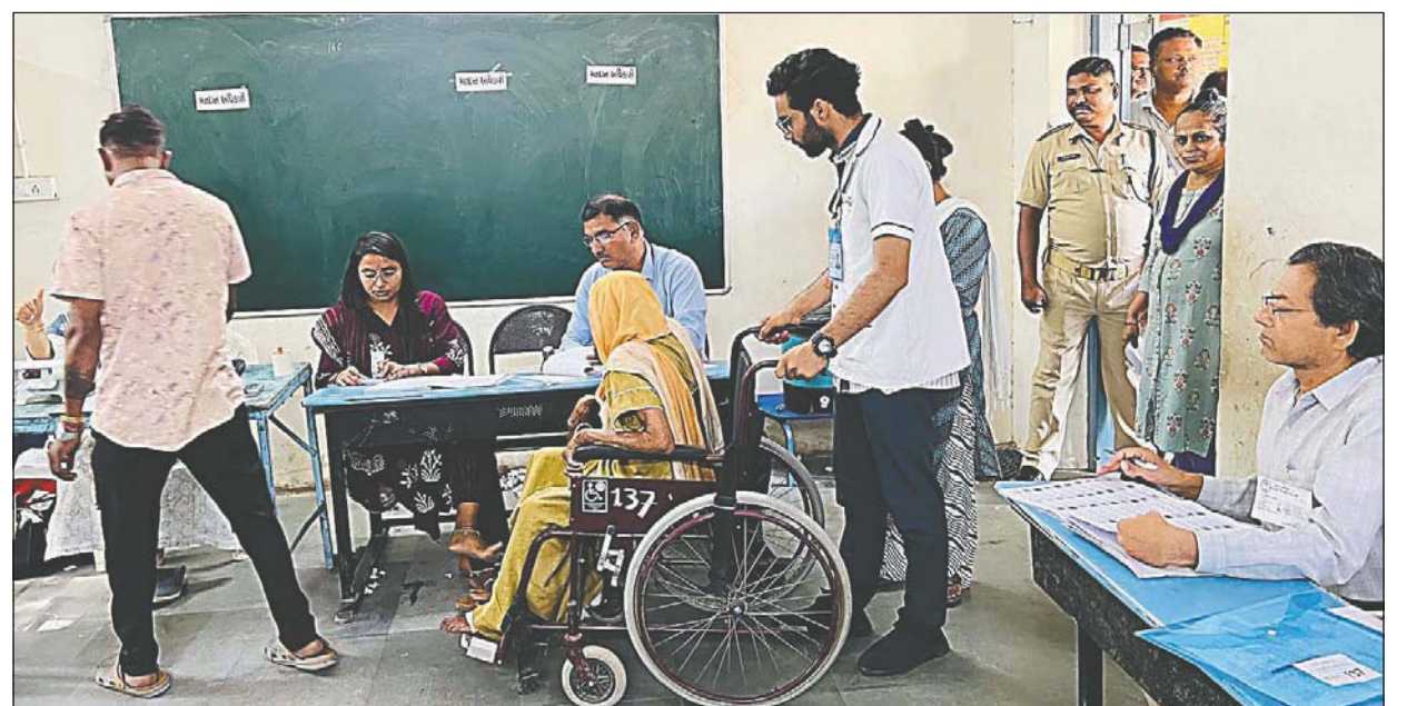
Voters of Ahmedabad cast their votes, at a polling booth, during the 3rd Phase of Lok Sabha Elections-2024, in Gujarat on Tuesday.

The Karnataka Government is trying to get a Blue Corner notice issued against him and coordinating with the CBI in this regard. At present, the SIT has issued a Lookout Notice for him.