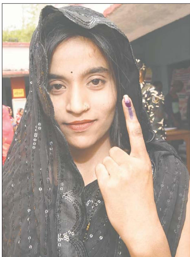
KHAGARIA, A voter shows her finger marked with indelible ink after casting her vote for the third phase of Lok Sabha elections, in Khagaria on Tuesday.