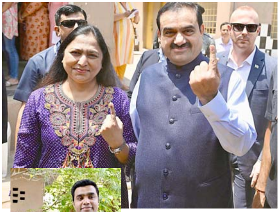
Gautam Adani, Founder and Chairman of Adani Group, cast his vote in Gujarat, along with his family members, during the third phase of the 18th Lok Sabha elections. "Proud to have voted with my family. Voting is a right, a privilege, and a responsibility we all share as citizens of this great nation," Gautam Adani posted on X. "Every vote is a powerful voice in our democracy. Cast your vote for shaping the future of India. Jai Hind," Gautam Adani added. Voting across 25 Lok Sabha constituencies in Gujarat began on Tuesday.