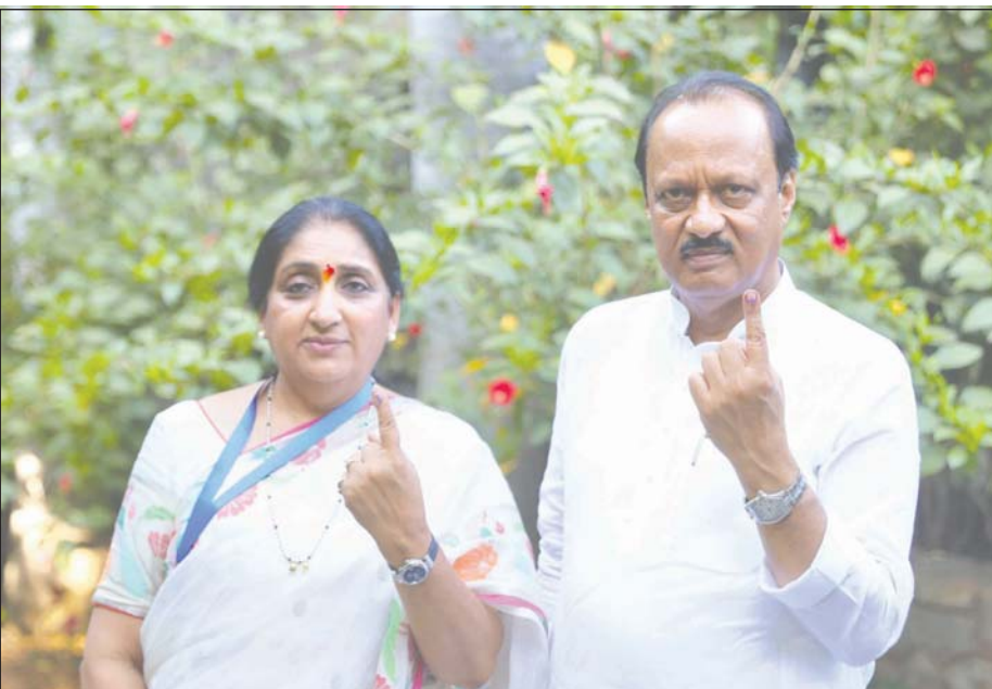
BARAMATI, Maharashtra Dy. CM Ajit Pawar shows his inked finger after casting vote at a polling station during the 3rd Phase of Lok Sabha polls, at Katewadi in Baramati, on Tuesday.

Since the beginning of polls on Tuesday morning the CPI(M) Politburo and the party's Secretary in West Bengal, Mohd Salim, who is the party candidate from Murshidabad Lok Sabha constituency, had been running from one booth to another trying to address the complaints of the booth agents there.