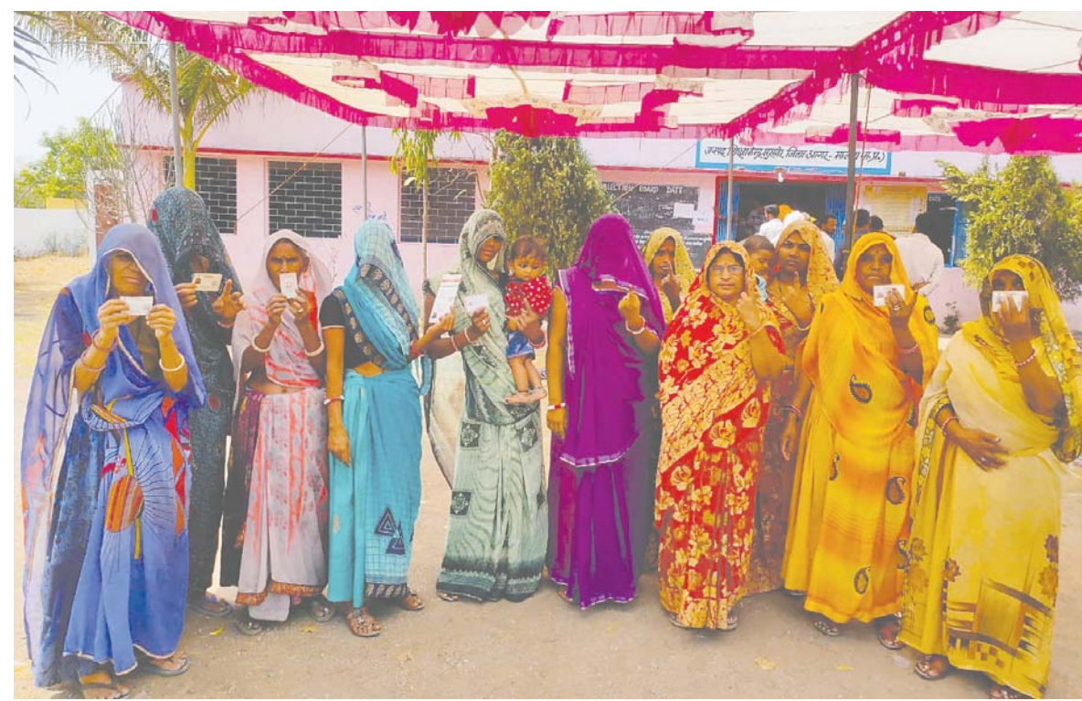
AGAR MALWA, Female voter showing their ink-marked finger after casting their vote at village Chhapria polling booth, during the 3rd Phase of Lok Sabha Elections-2024, in Agar Malwa on Tuesday.

Bhopal, May 7 (IANS) Polling across nine parliamentary constituencies in Madhya Pradesh began on Tuesday morning in the third phase of the Lok Sabha elections. Long queues of voters were seen at polling booths in the morning as many of them wanted to exercise their franchise before the temperature rises. Besides the state capital Bhopal, voting is underway in Gwalior, Morena, Bhind, Rajgarh, Guna, Sagar, Betul and Vidisha parliamentary constituencies. The Election Commission has set up 20,456 polling booths across the nine seats for over 1.77 crore eligible voters.