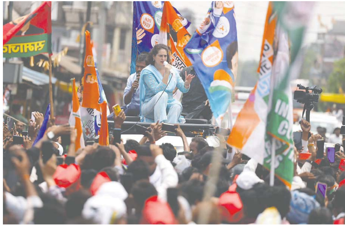
RAE BAREILLY, Congress General Secretary Priyanka Gandhi Vadra addressing supporters at an election rally in support of Party candidate Rahul Gandhi for Parliamentary election-2024 in Rae Bareilly on Wednesday.