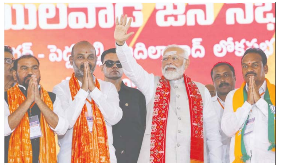
KARIMNAGAR, PM Narendra Modi with Bandi Sanjay Kumar and other BJP leaders at a public meeting for Lok Sabha polls, in Karimnagar, Telangana on Wednesday.

"The Congress had promised pensions for the martyrs' families in Telangana, 250 square yards of land, and Rs 2,500 per month for every woman, but none of these promises have been fulfilled," he said. Alleging that power cuts have made people's lives miserable in Telangana, the Prime Minister said, "Ever since the Congress came to power, development of Telangana has come to a standstill while the public treasury has emptied.