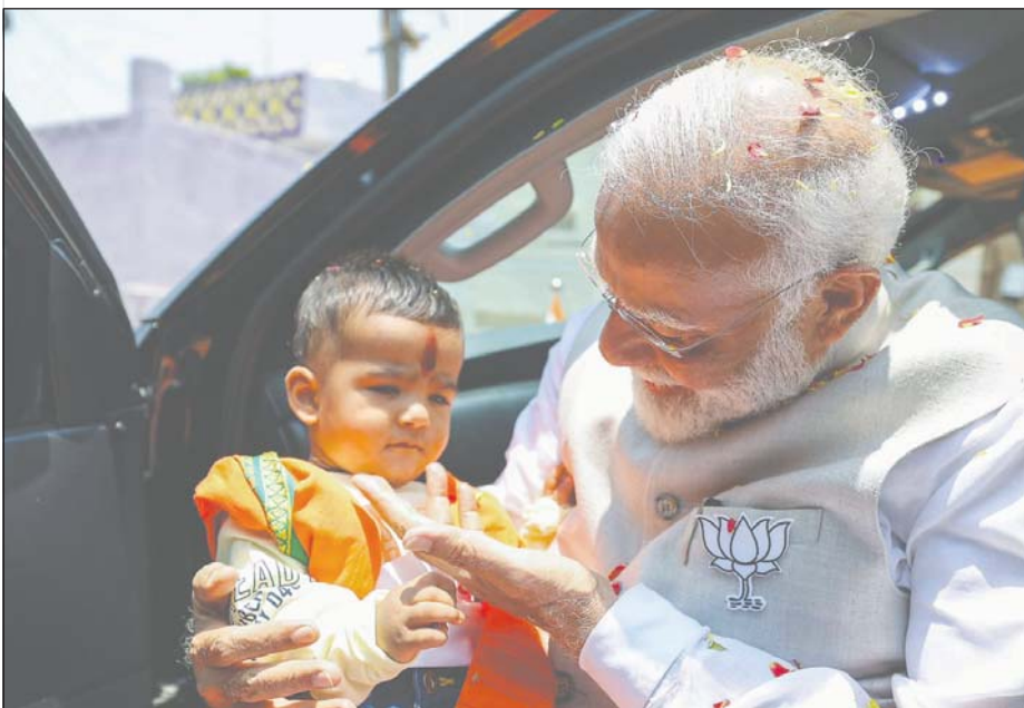
WARANGAL, Prime Minister Narendra Modi holds a child at Lakshimpuram village on his way to a campaign rally for Lok Sabha polls, in Warangal, Telangana on Wednesday.

Heaping praise on PM Modi's Viksit Bharat 2047 vision, he said that a long-sighted goal is essential for achieving such tasks and urged everyone including youth and fellow teachers to become 'ambassadors' of this change.