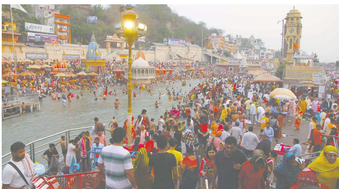
HARIDWAR, Devotees taking holy dip in the Ganga at Har Ki Pauri on the occasion of Amavasya, in Haridwar on Wednesday.

Taking a cue from his Inheritance tax theory, the BJP brass had accused Congress of planning to impose high taxes on the common man and thereby usurping a major chunk of their wealth, after death.