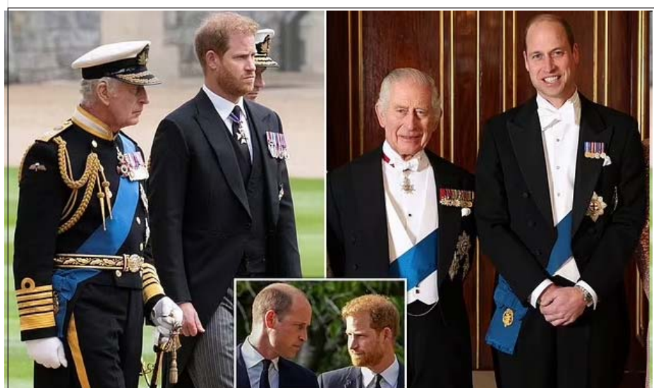
Last night, Buckingham Palace announced that Prince William and his father would be attending a joint engagement next week, where the heir will be made the Colonel-in-Chief of the Army Air Corps. Prior to Prince Harry's decision to step back from royal life, it was always thought he would take on the role that would see him take charge of the regiment he was toured Afghanistan with until 2014.

Through this investment, the Resourcing Australia's Prosperity (RAP) programme will be fully funded for 35 years, setting Australia's resources industry up for decades of exploration and future economy-making discoveries.