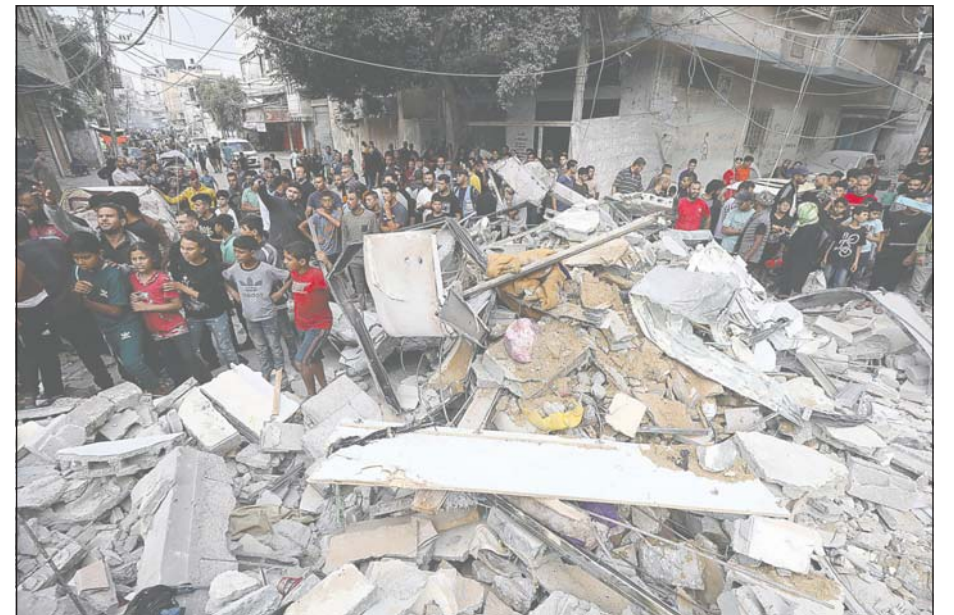
GAZA, People gather at the site of an Israeli airstrike in the Nuseirat refugee camp, central Gaza Strip, on May 14, 2024. At least 40 people were killed and others injured after midnight Monday by Israeli bombardment in the Nuseirat refugee camp in the central Gaza Strip, the Palestine TV reported.

The SIT has registered cases under IPC Sections 376 (2) N (committing rape repeatedly on same woman), 506 (criminal intimidation), 354 (A) (1) (behaving in unwelcome way, explicit sexual behaviour, demanding sexual favours), 354 (B) (using criminal force on woman) and 354 (C) (voyeurism, capturing image of a woman in a private act without her consent) and Under Sections of the Information Technology Act.