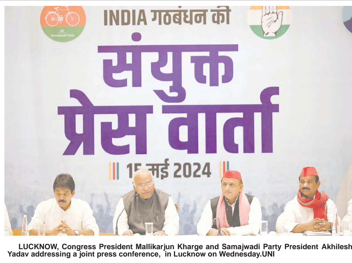
LUCKNOW, Congress President Mallikarjun Kharge and Samajwadi Party President Akhilesh Yadav addressing a joint press conference, in Lucknow on Wednesday.

Thiruvananthapuram, May 15 (IANS) The now controversial private visit of Kerala Chief Minister, Pinarayi Vijayan and his family was cut short and on Wednesday morning they reached Dubai, UAE. CM Vijayan had left India on May 6 for a three-nation tour of Indonesia, Singapore and UAE and was scheduled to return to the country on May 22. However, on Wednesday while chairing the online weekly Cabinet meeting from Dubai, he informed his colleagues that he would reach Kerala on May 20.