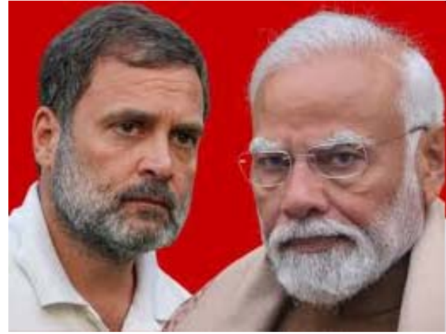
Ministers Rajnath Singh and Nitin Gadkari and Chief Ministers of BJP-ruled states also campaigned in Madhya Pradesh.

Polling in Madhya Pradesh was held in four phases between April 19 and May 13 to elect 29 members of the Lok Sabha. Results will be declared on June 4.