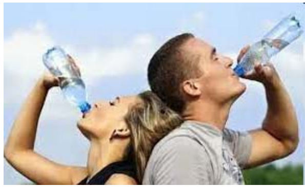
New Delhi, May 15 (IANS) Extreme temperatures above 40 degrees Celsius that impacted billions of people across Asia in April were made hotter and more likely by human-caused climate change, according to rapid attribution analysis by an international team of leading climate scientists from the World Weather Attribution group.

The Chabahar project is a potential component of the International North-South Transport Corridor, envisioned by Russia, Iran and India to link South Asia with Central Asia and Europe. Tensions within Europe, as well as between Iran and the West, make this important project a challenging one. The India-Middle East-Europe Economic Corridor, announced at the G20 summit in Delhi last year, has great potential as well. Formulated as a counter to BRI, it seeks to build road, rail and shipping networks through India's near-West to Western Europe.