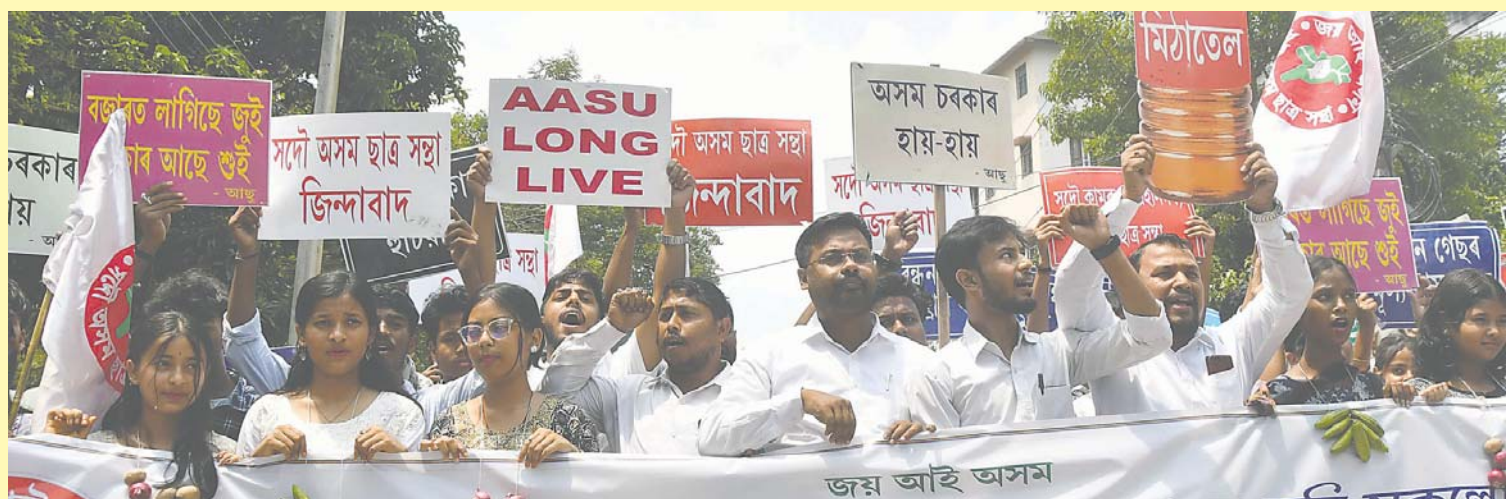
GUWAHATI, All Assam Students Union (AASU) raising slogans during a demonstration in protest against the price hike of essential commodities, in Guwahati on Wednesday.

"After the INDIA bloc forms government, a list of poor people including Dalits, Adivasis, minorities, poor general caste people, farmers, and labourers will be prepared. One woman member will be selected from each of the poor families from the list and the woman member of the family will find Rs 8,500, as monthly instalments of a total of Rs 1 lakh, deposited in their bank accounts from July 4 onwards," he said. The senior Congress leader said that the 50 per cent backward class people, 15 per cent Dalits, eight per cent adivasis, 15 per cent minorities, and five per cent poor general caste people don't have any share in any sector, business, media, or government.