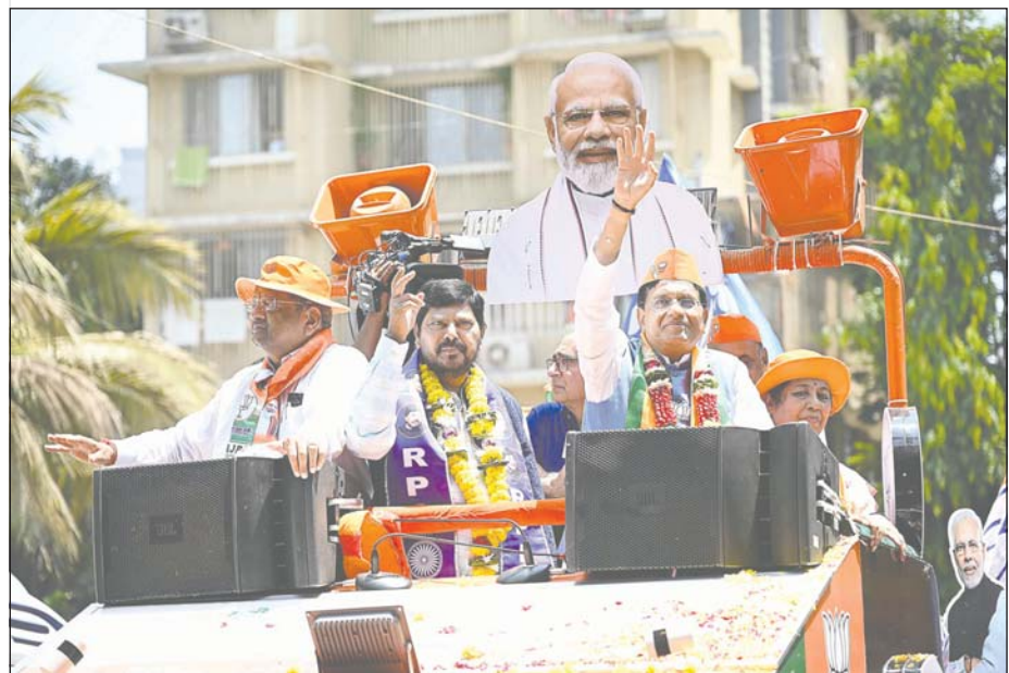
MUMBAI, Union Minister and BJP candidate from North Mumbai seat Piyush Goyal at a campaign road show for Lok Sabha polls, in Mumbai on Wednesday