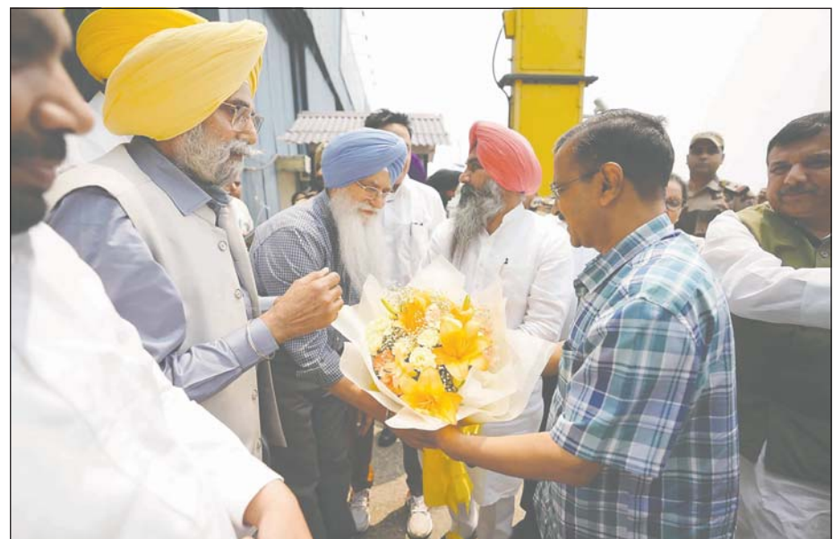
AMRITSAR, Delhi Chief Minister and AAP Supremo Arvind Kejriwal being welcomed upon his arrival for a rally for Lok Sabha elections, in Amritsar on Thursday.